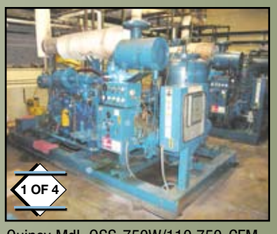
Quincy Mdl. QSS-750W/110 750-CFM Compressors