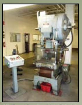
32-Ton Minster Mdl. B1-32 High Speed Press