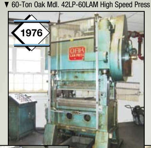
1 OF 20