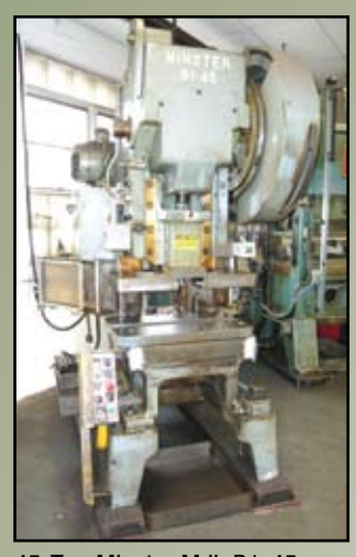
45-Ton Minster Mdl. B1-45 High Speed Press