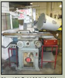
6" x 18" Reid Mdl. 618H Surface Grinder, with Diaform Dresser