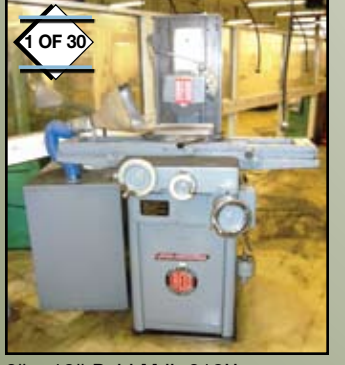
6" x 18" Reid Mdl. 618H "Rollerway" Surface Grinder

Precision Metal Stamping & Assembly Manufacturer