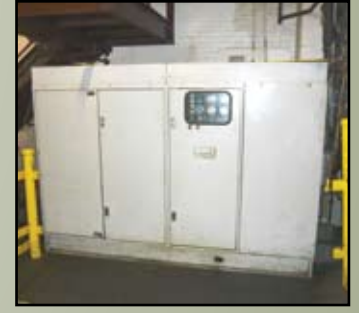
150HP Joy Mdl. 690 Air Compressor