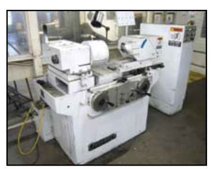
Overbeck Mdl. 3501 ID Grinder

AUCTIONEERS • LIQUIDATORS • APPRAISERS 555 Broadhollow Road, Melville, New York 11747 (631) 454-1766 • Fax (631) 454-1779