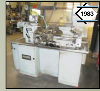
Hardinge Mdl. TFB/HLV-H Lathe