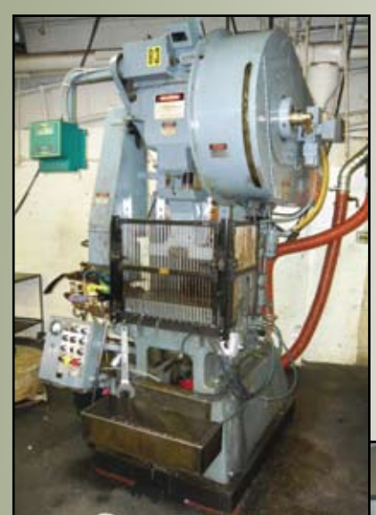
▲ 32-Ton Minster Mdl. B1-32 High Speed Press

Featuring: [20] High Speed & OBI Minster & Oak Presses • [20] Nilson & Sleeper and Hartley 4-Slides (New as 1982) • [30] Reid Surface Grinders • Comparators • Toolroom Machinery • Moore Jig Grinder Lab Equipment Compressors Large Quantity of Shop Related Equipment