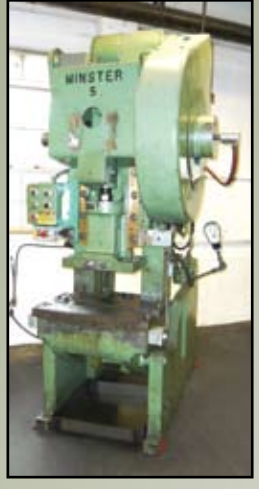
45-Ton Minster #5 OBI Flywheel Type Press